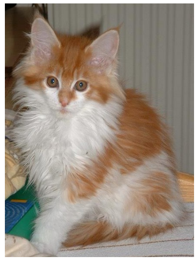
201 bite reports on CATS Tested 43 with NO positive results

Submitted By:Andee Bowman Environmental Health Alachua Co. Health Dept.