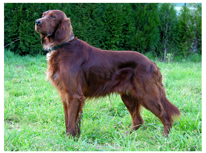
499 bite reports on DOGS Tested 13 with NO positive results