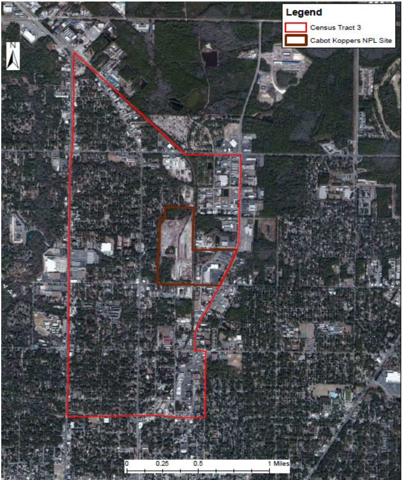
Map 1. Aerial view of the Stephen Foster Neighborhood (Census Tract 3) Alachua County with Cabot Koppers site Highlighted